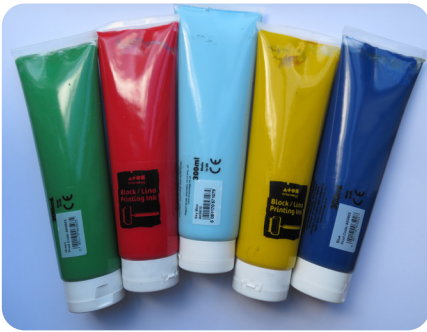
coloured printing inks