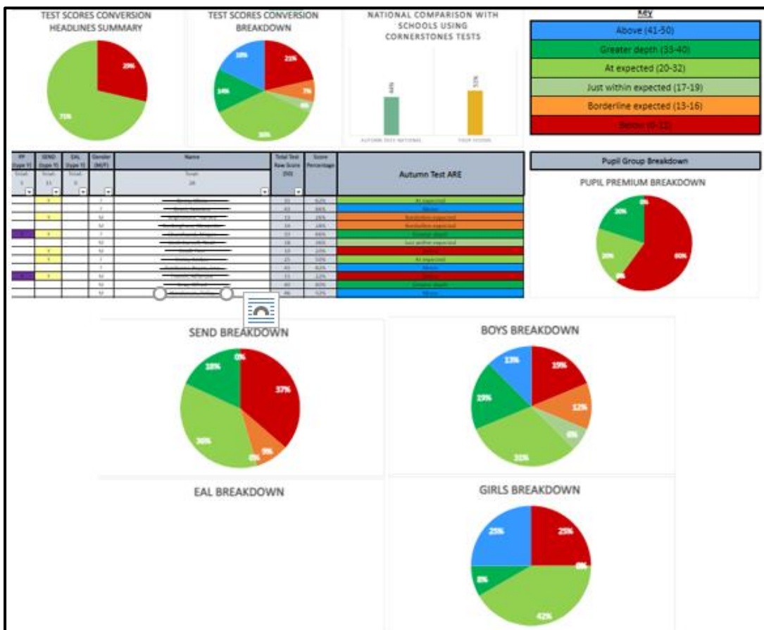
Example of a SPaG data analysis with a breakdown in specific groups.